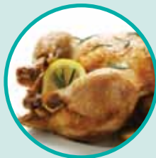
Chicken and turkey